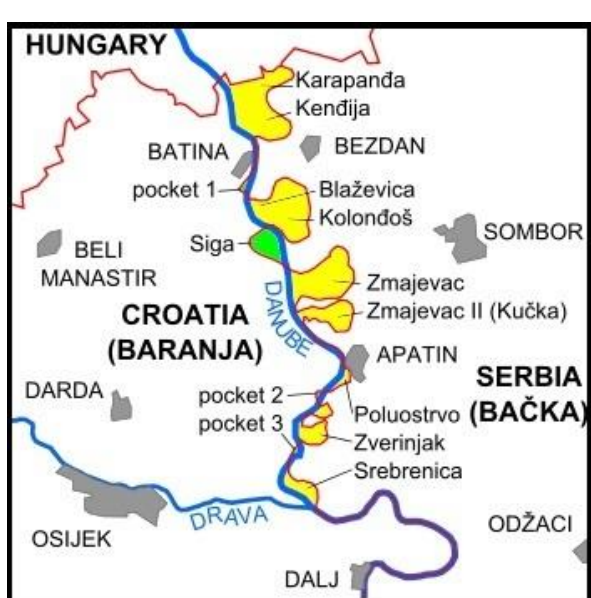
Figure 3.1. Croatian suggestion for resolving the border issue with Serbia. Yellow area marks parts of the Serbian territory that are claimed by Croatia, while the green area marks the parts of the Croatian territory that, according to the Croatian claims, belong to Serbia.

However, what troubles Serbia in this case is that Croatia is the member of the European Union. Therefore, it can impose the same scenario on Serbia, as Slovenia did on Croatia, when it blocked the negotiations between the EU and Zagreb for almost a year in 2008 due to a dispute about the Gulf of Piran. According to the Croatian Prime Minister Zoran Milanovic, his country will not hesitate to put this condition in front of Serbia during its negotiation process. On the other hand, a strong argument against the Croatian claims it that "if this issue were solved following Croatian arguments, management of river navigation would become extremely complicated and both sides would control enclaves on the other side of the river." This can easily be observed in figure 3.1.